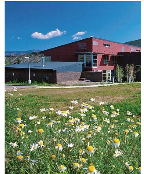
Traditional and non-traditional students in the Morgridge Family Academic Center.